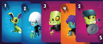
An example of a horde set