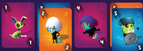
An example of a player's collection