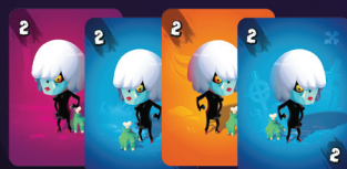
Another example of a horde set

When you complete a horde set, take any one card from the completed set and place it face down next to your collection. This card is worth 10 VP at the end of the game, and cannot be lost. Place the rest of the cards from the completed horde set into the discard pile.